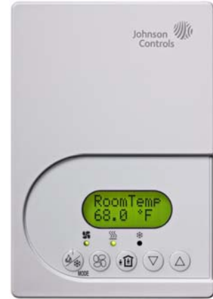
TEC2645-4 BACnet MS/TP Networked Thermostat Controller with Single Proportional Output and One-Speed Fan Control