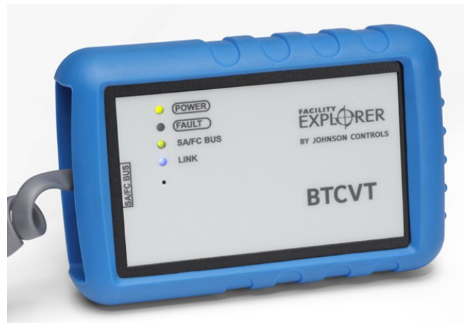
Figure 1: Bluetooth Commissioning Converter

If the product fails to operate within its specifications, replace the product. For a replacement product, contact the nearest Johnson Controls® representative.