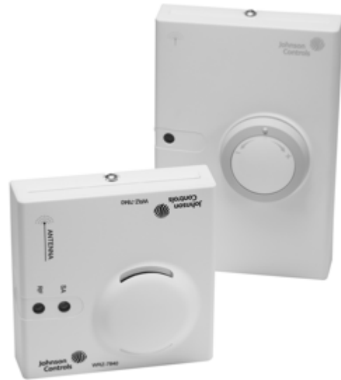
Facility Explorer One-to-One Wireless Room Sensing System