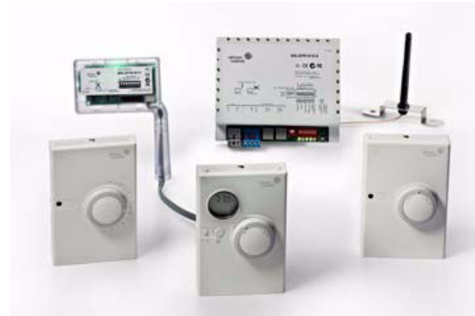
FX-ZFR1811 Routers (Top Left), FX-ZFR1810 Coordinator (Top Center), and FX-WRZ Series Sensors (Bottom)